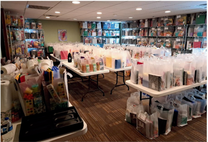
Over 800 students supplied!