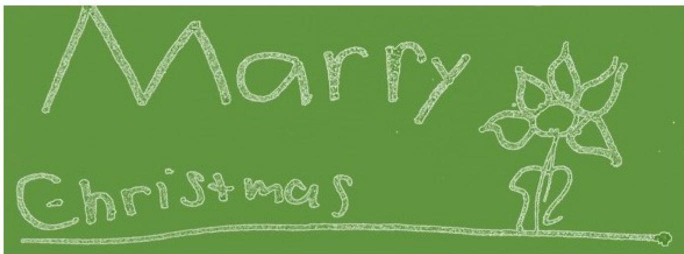
A drawing by one of the child recipients to say “thank you” for his gifts last year.