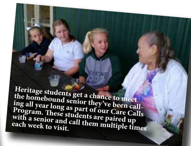
Heritage students get a chance to meet the homebound senior they've been calling all year long as part of our Care Calls Program. These students are paired up with a senior and call them multiple times each week to visit.